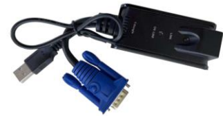
CAT6 KVM Dongle-USB&VGA (DGU)